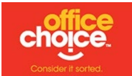
Exhibit Information 2025

No Exhibit may be removed from Pavilion before 10:30 pm on Saturday night of Show unless arranged with Head Steward. All exhibits to be collected Sunday between 9am to 1.00pm.